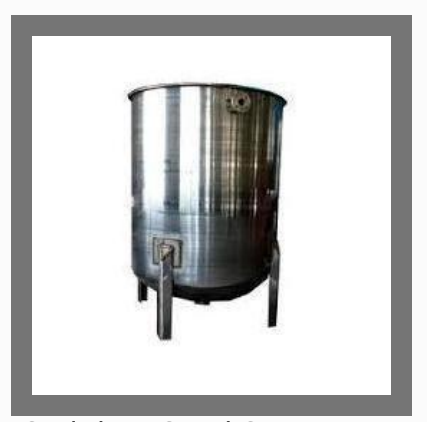
Stainless Steel Storage Tank