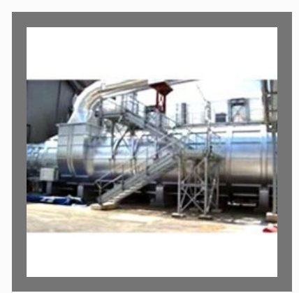
SS DDGS Dryers