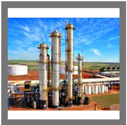
Fuel Ethanol Process Plants