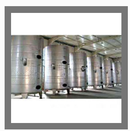
Reactor for Pharma & Food Pressure Vessels