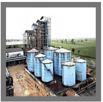
Rectified Spirit Plant