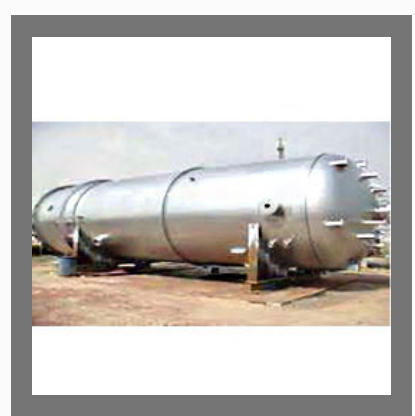
SS Pressure Vessels