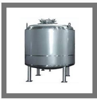
SS Storage Tank