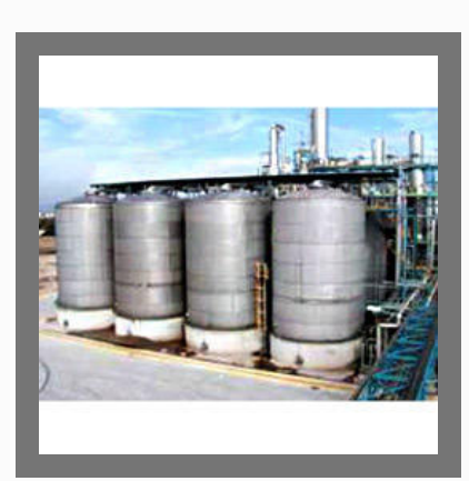
Molasses/Grain Fermentation Plant